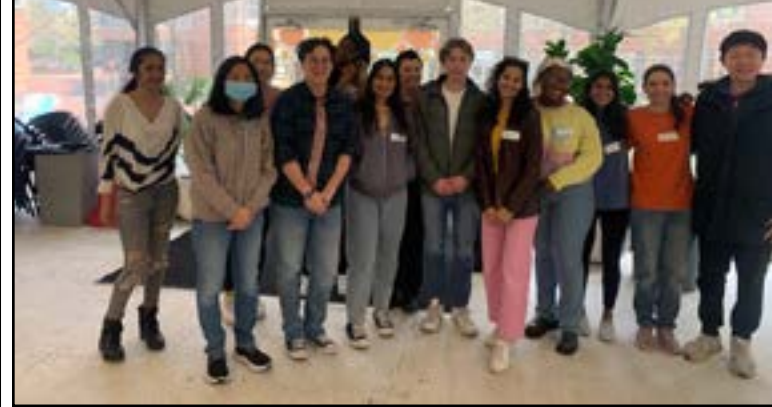
HEI gathering in OCtober 2021